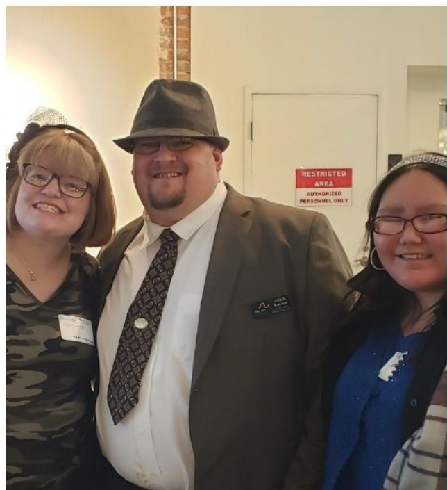
Speaking for Ourselves group in the Capital