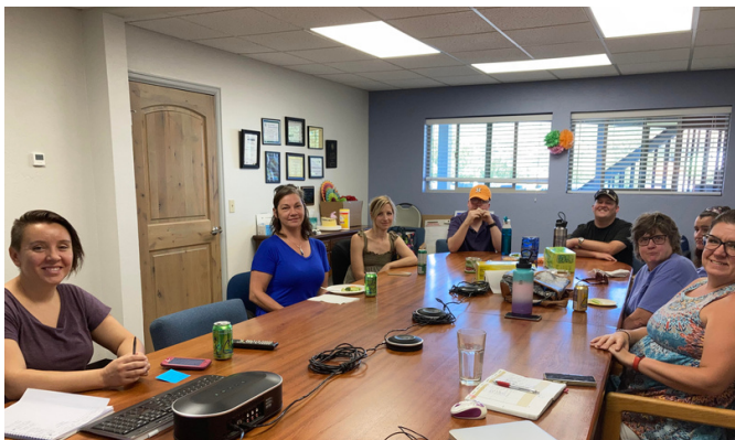
SPEAKING FOR OURSELVES FIRST IN PERSON INSIDE MEETING