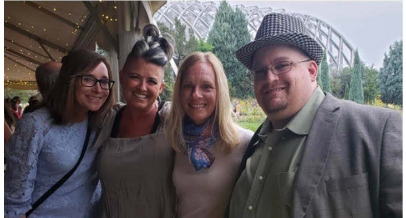
ARC THRIFT CELEBRATION LAST FALL