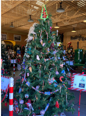
FESTIVAL OF TREES

Our activities were limited in 2021 but we still managed to participate in The Dave Spencer Classic, Festival of Trees, and stuffed over 300 hygiene socks.